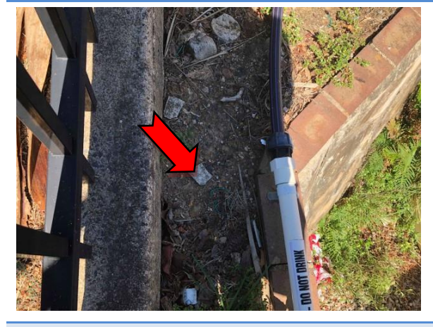
Photo Exterior, south-eastern elevation, to ground 3. surface - asbestos-containing fibre cement sheeting debris.