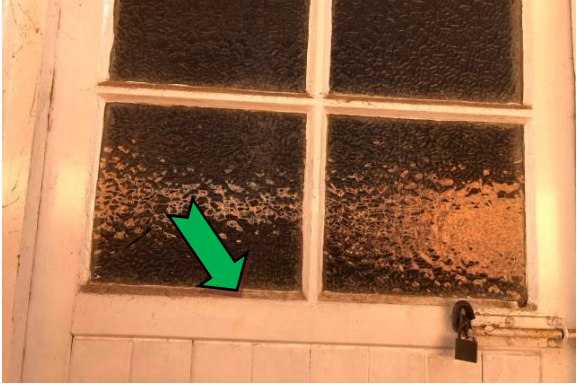
Photo Exterior, east elevation, shed, door - non 5. asbestos-containing window caulking.