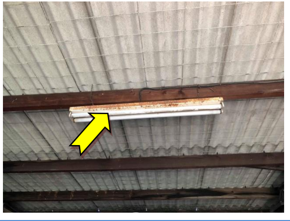
Photo Interior, east elevation, shed, double tube 10. fluorescent light fitting – suspected PCB-containing capacitor.