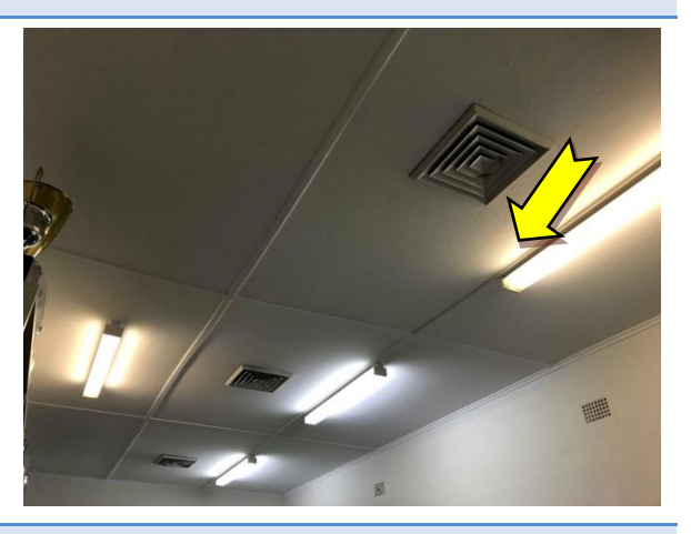
Photo Interior, Canterbury soccer football office, main office, ceiling – asbestos-containing fibre 6. cement sheeting.