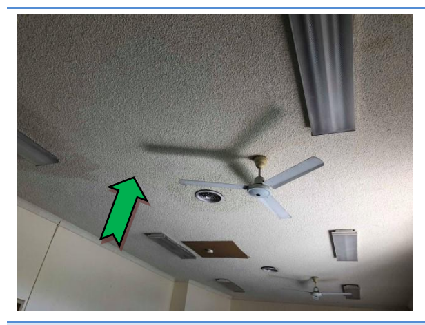
Photo Interior, bar area, ceiling – non asbestos-containing vermiculite.