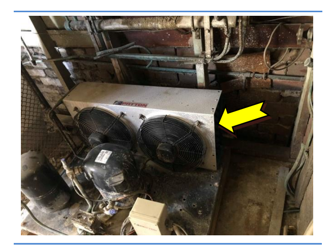
Photo Exterior, back of house area, unknown 13. refrigerant – suspected ODS-containing refrigerant gas.