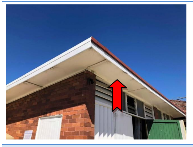
Photo Exterior, eastern elevation, shed, eaves -1. asbestos-containing fibre cement sheeting.