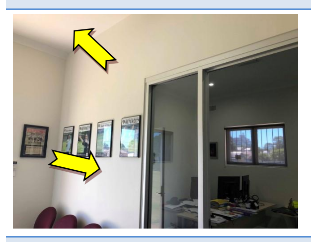
Photo Interior, throughout, walls and ceiling –suspected lead-containing cream and white upper coloured paint systems.