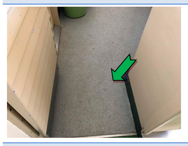
Photo Interior, bar area, floor coverings – suspected9. non asbestos-containing sheet vinyl.