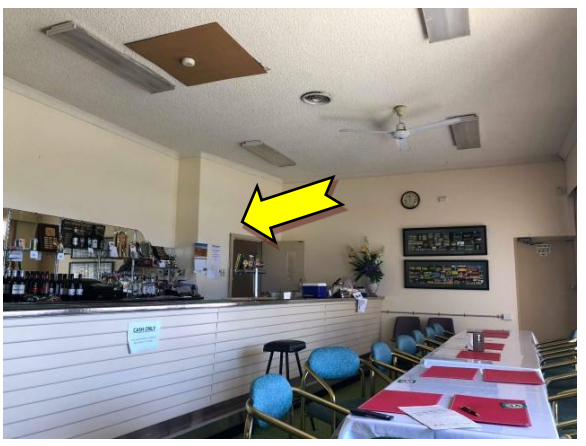
Photo Interior, events room and bar area, walls –suspected lead- containing yellow upper paint system.