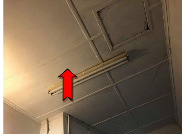
Photo Interior, bar and kitchen toiler areas, ceiling –asbestos-containing fibre cement sheeting.